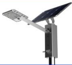
Solar Street Light