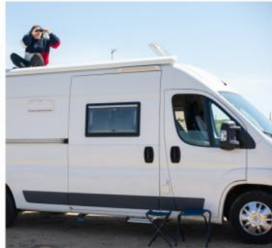
RV energy storage