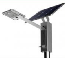
Solar Street Light