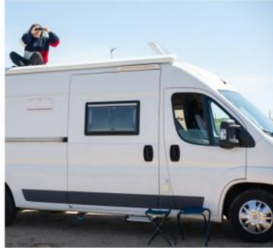
RV energy storage