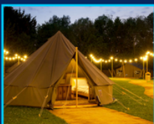
Household energy storage