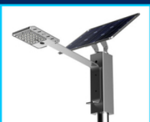
Solar Street Lighth