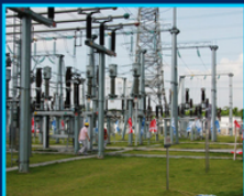
Power Station energy storage