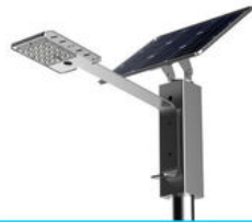
Solar Street Lighth