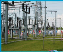
Power Station energy storage