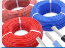
Pure copper flame retardant wire