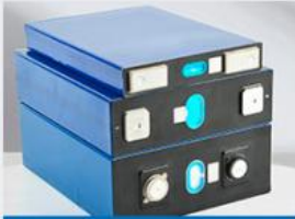
Automotive Grade Cells