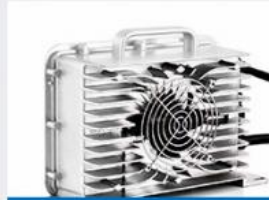
Lithium battery charger, waterproof IP65