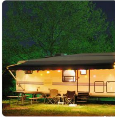
RV Energy Storage