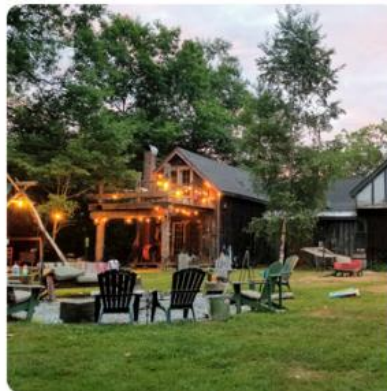
Home Back Up Electricity