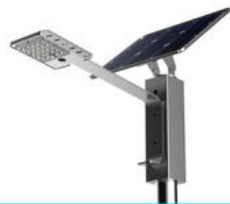
Solar Street Lighth