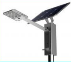
Solar Street Lighth