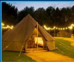
Household energy storage