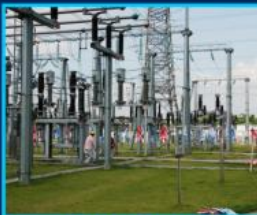
Power Station energy storage