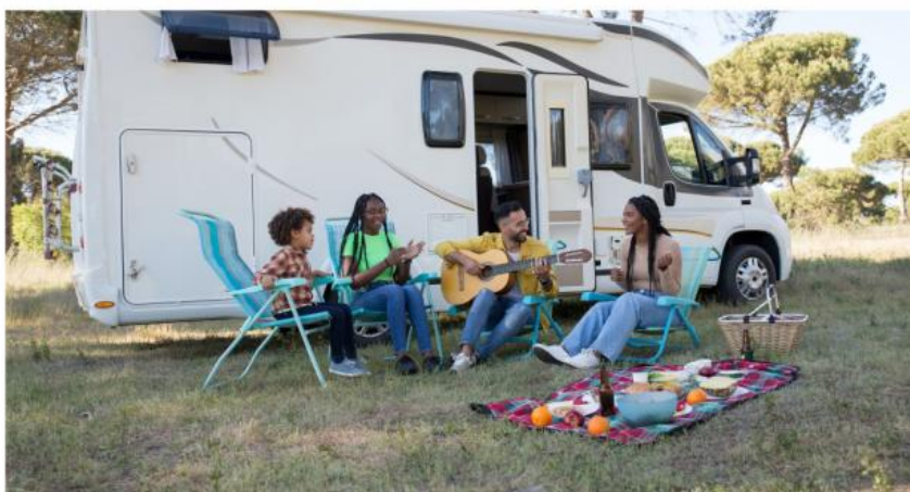
Backup power for outdoor camping