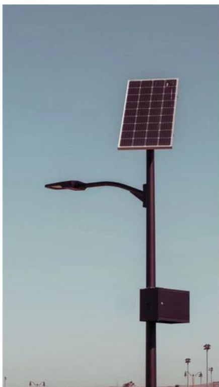
Solar street lamp