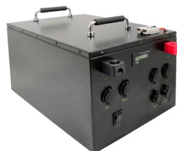
Energy storage lithium battery