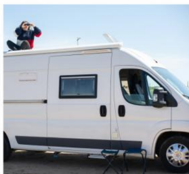
RV energy storage