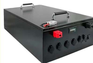
Energy storage lithium battery