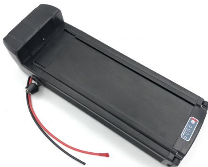
60V 15AH Battery Pack

We have been in lithium battery pack for more than 8 years and know how to provide you the right solution for you. Just let us know your detail application and request then we will choose the best solution for you.