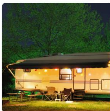
RV Energy Storage