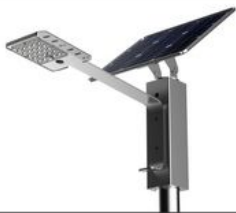
Solar Street Light