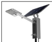
Solar Street Light