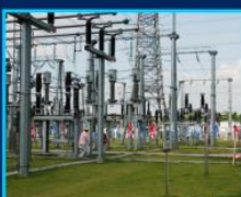
Power Station energy storage