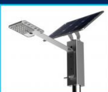
Solar Street Lighth