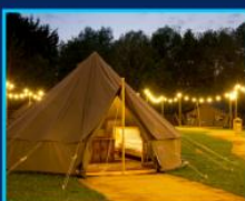
Household energy storage