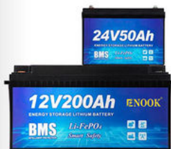
12V & 24V SERIES ENERGY STORAGE LITHIUM BATTERY