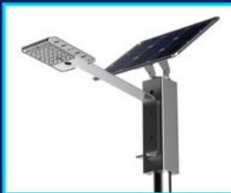
Solar Street Ligth