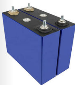
Lifepo4 battery 3.2V 304A