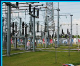
Power Station energy storage