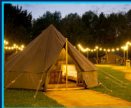
Household energy storage