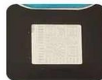
Complete QR Code