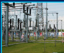
Power Station energy storage