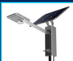
Solar Street Ligh