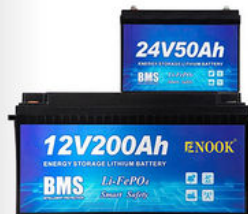
12V & 24V SERIES ENERGY STORAGE LITHIUM BATTERY