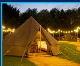
Household energy storage