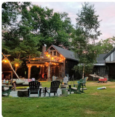
Home Back Up Electricity