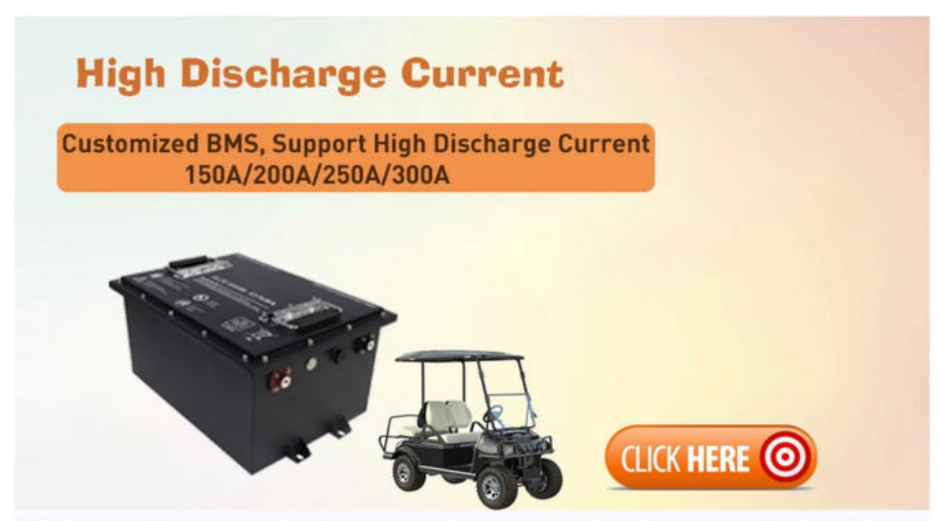
Over 16 Years industry experience in Lithium Ion Batteries