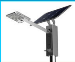
Solar Street Ligh