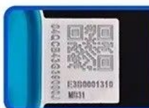
COMPLETE QR CODE