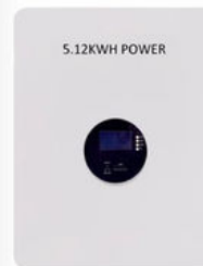
Solar LiFePO4 B5.12KW 51.2V 100Ah 200Ah battery