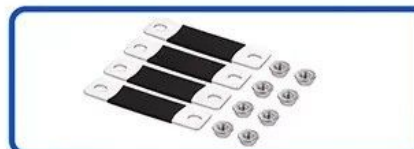
FREE BUS BARS AND GRUB SCREW&NUT