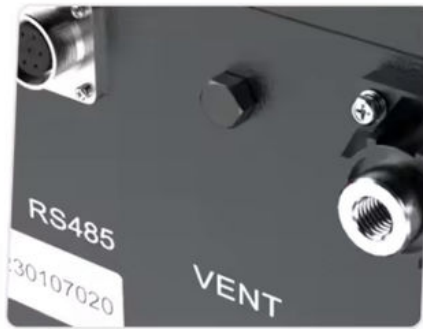
Help to vent internal gases