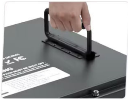
Easy to carry with handles