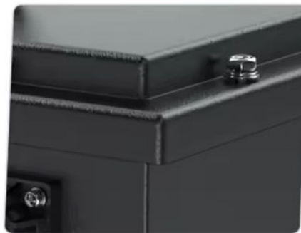
Metal material is more sturdy