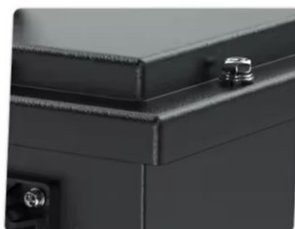
Metal material is more sturdy