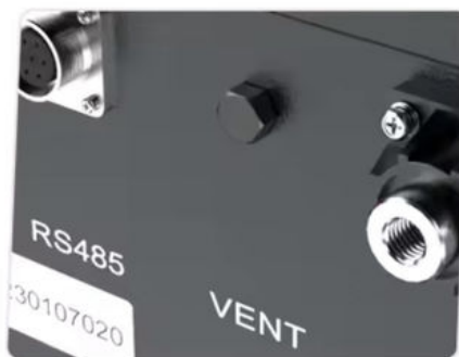
Help to vent internal gases