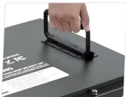
Easy to carry with handles