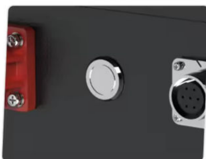
Intelligent one-button control ON/OFF